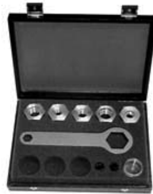
Set of adapters in a tool case