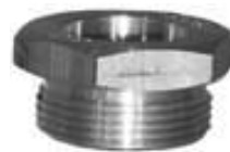
Threaded adapter with female thread for knurled nut M28 x 1.5

*) For these threaded adapters the sealing insert specified below is required in order to fit them into knurled nuts M28 x 1.5.